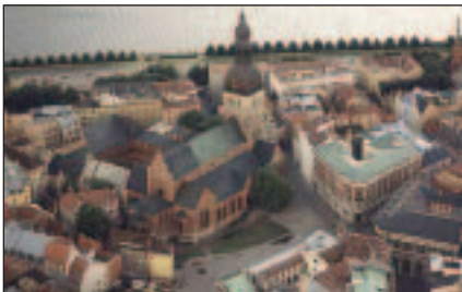
Loze & Partners (Riga, Latvia)