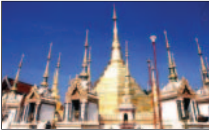
Blumenthal, Richter & Sumet (Bangkok, Thailand)