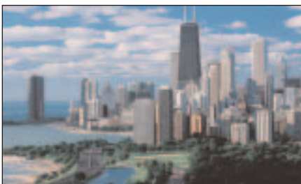
Neal, Gerber & Eisenberg (Chicago, Illinois, U.S.A.)